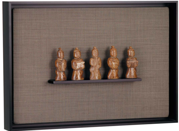
Terra cotta warriors from a trip to Asia are creatively displayed in a military format in a float frame.

Creating memories is important, but just as important is keeping them and holding on to them forever. By displaying your treasures in a float frame or shadowbox, your memories will be preserved for generations to come. ■