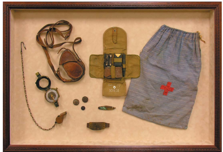
A grandfather's World War I memories are preserved in a beautifully designed shadowbox.